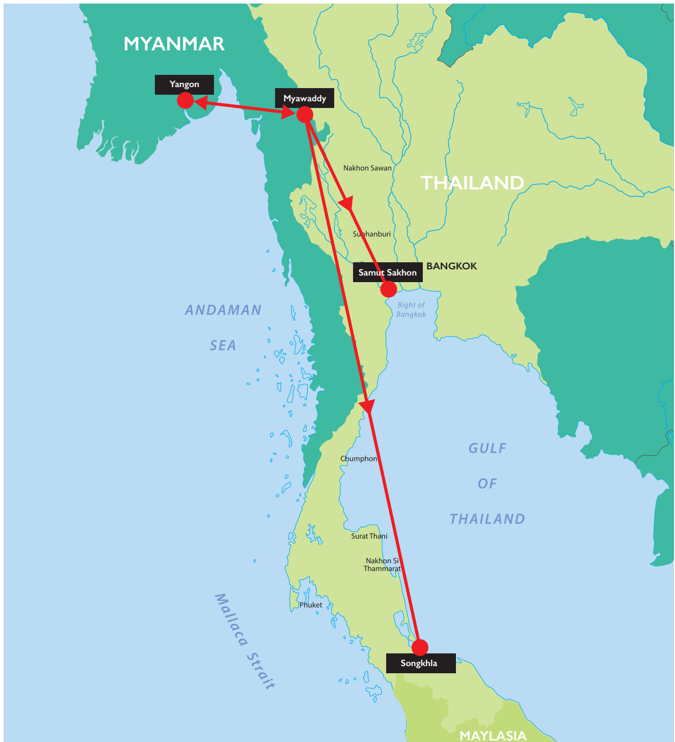
Figure 1 – The recruitment journey

TU launched and implemented the Policy with the support of the Migrant Workers Rights Network (MWRN), a membership-based civil-society organisation for migrant workers from Myanmar residing and working primarily in Thailand.